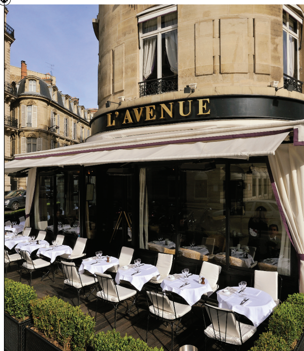
Restaurant L'Avenue, Paris; Bill's Food , by Bill Granger