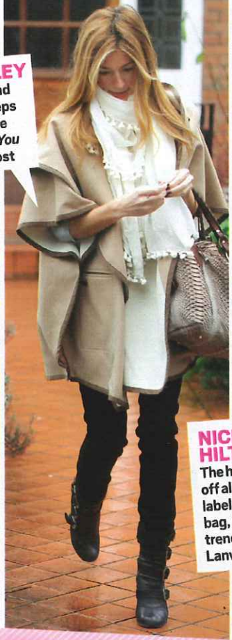
CAT DEELEY A Zara cape and cosy scarf keeps the chill off the So You Think You Can Dance host