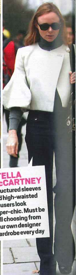
STELLA MCCARTNEY Structured sleeves and high-waisted trousers look super-chic. Must be hell choosing from your own designer wardrobe every day