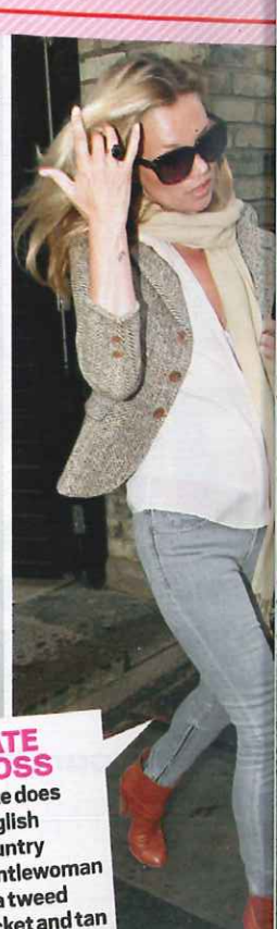
KATE MOSS Kate does English country gentleness in a tweed jacket and tan shoes