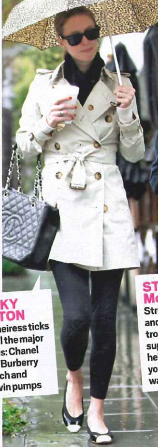
NICKY HILTON The heiress ticks off all the major labels: Chanel bag, Burberry trench and Lanvin pumps