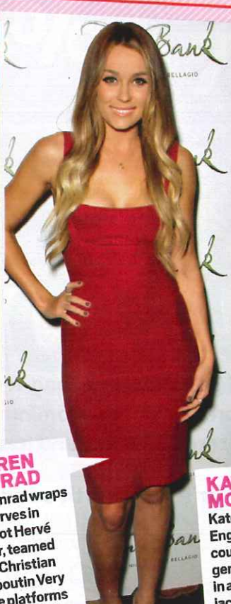
LAUREN CONRAD Ms Conrad wraps her curves in red-hot Hervé Léger, teamed with Christian Louboutin Very Prive platforms